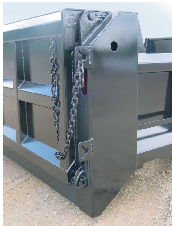
Pictured is a close view of the 15" 10 gauge rear corner post and 10" deep rear bolster. Also pictured is the double acting tarp friendly hardware.

Galion-Godwin Truck Body Co. LLC. 7415 Peabody-Kent Rd. Winesburg OH. 44690 P.O. Box 208 (877) 450- 4794 Fax (330) 359-5660