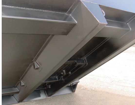
Pictured is a close view of the 450U's cross-memberless understructure and heat ducts.

FULL FACTORY WARRANTY complete parts and service available Through nationwide authorized distributors