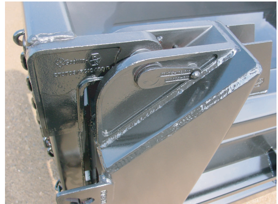
Pictured is a close view of the upper tarp friendly hardware of the standard 400USS body. This hardware makes it easy to quickly remove and reinstall the tailgate as needed

FULL FACTORY WARRANTY complete parts and service available through nationwide authorized distributors