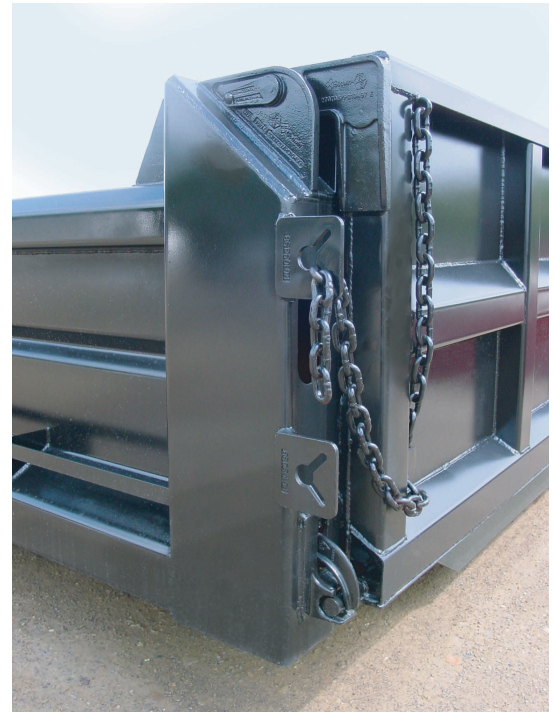
Pictured is a close view of the full-depth rear corner post with double chain adjusters and 8 gauge high tensile steel rear bolster.

Galion-Godwin Truck Body Co. LLC. 7415 Peabody-Kent Rd. Winesburg OH. 44690 P.O. Box 208 (877) 450- 4794 Fax (330) 359-5660