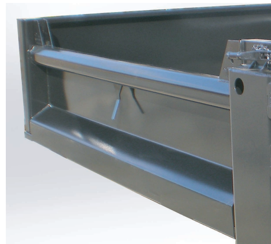
Optional dropside with single lever release. Side drops well below deck level for easy cleanout.