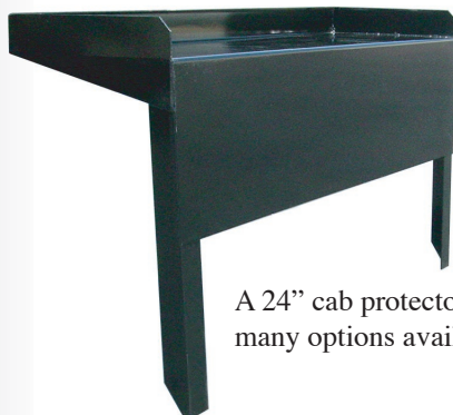
A 24" cab protector is one of many options available on the 500U/T.

Visit Galion and all affiliated companies on the world wide web. www.galiongodwin.com