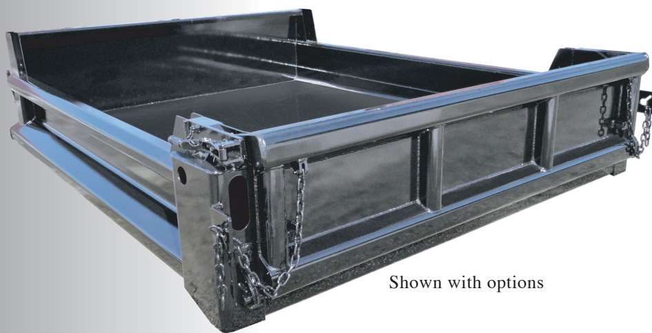
Shown with options

FULL FACTORY WARRANTY complete parts and service available through nationwide authorized distributors