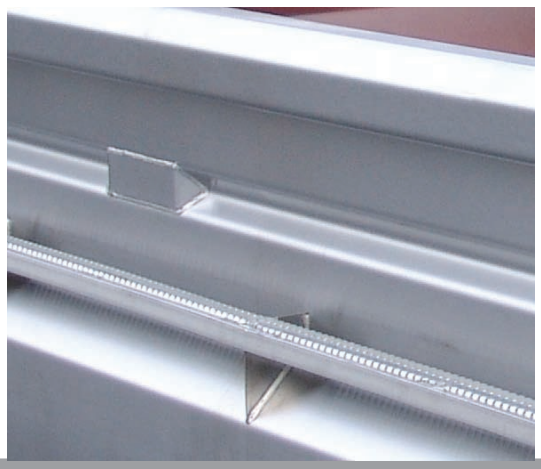
Pictured is the horizontal pressed "V" brace which is standard equipment on both the 530U and 533U.

The crossmemberless understructure of the 530U and 533U bodies use 3/16" X 100K formed 10" formed trapezoidal longbeams.