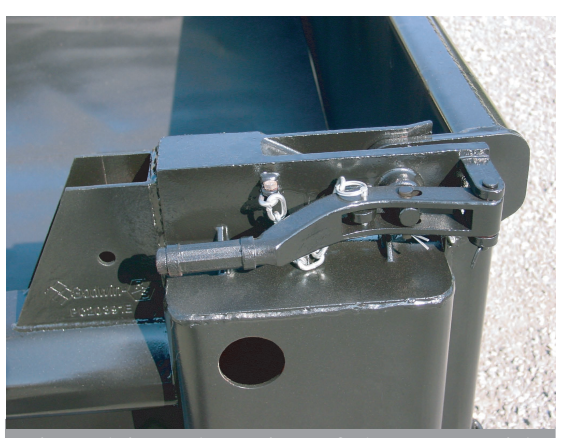
Pictured is a close view of the upper quick release hardware. This hardware makes it easy to quickly remove and reinstall the tailgate.

Galion-Godwin Truck Body Co. LLC. 7415 Peabody-Kent Rd. Winesburg OH. 44690 P.O. Box 208 (877) 450- 4794 Fax (330) 359-5660